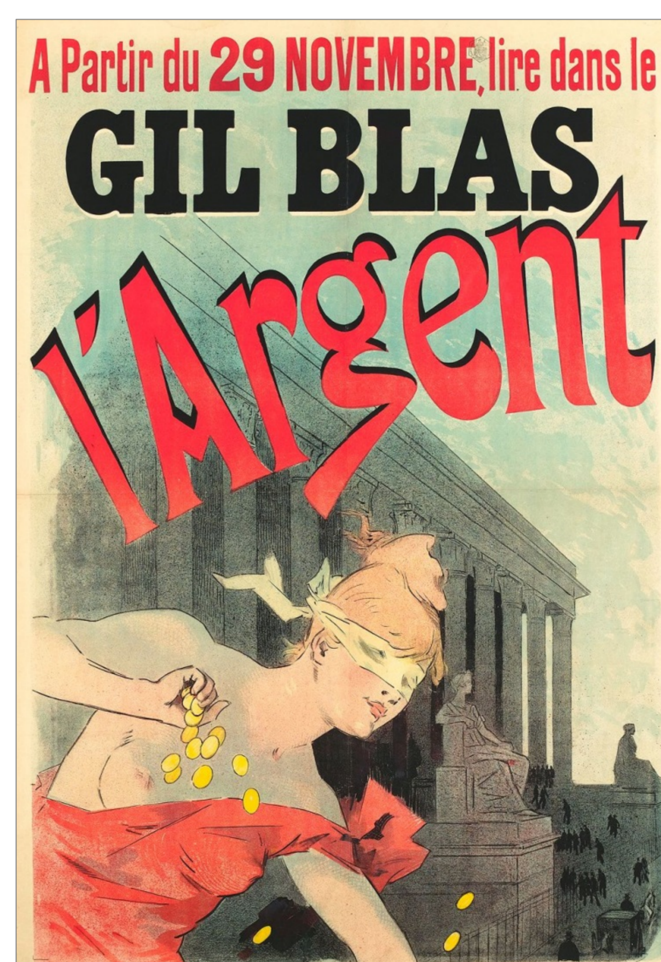
Gil Blas, 1890: Jules Cheret: Poster for Emile Zola's serialized novel „L'Argent“

MARCHÉS FINANCIERS How to participate in the profits of capitalism?