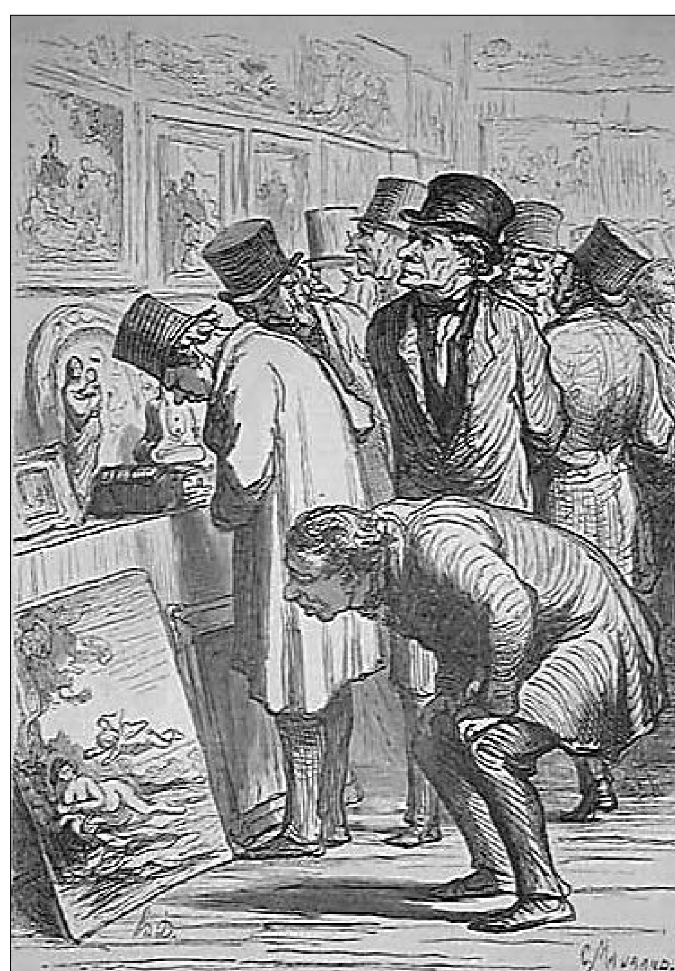
Le Monde Illustré, 10.5.1862: Honoré Daumier: "Une salle de l'hôtel Drouot, un jour d'exposition"

FAILLITE ET BANQUEROUTE The failure of the honorable merchant