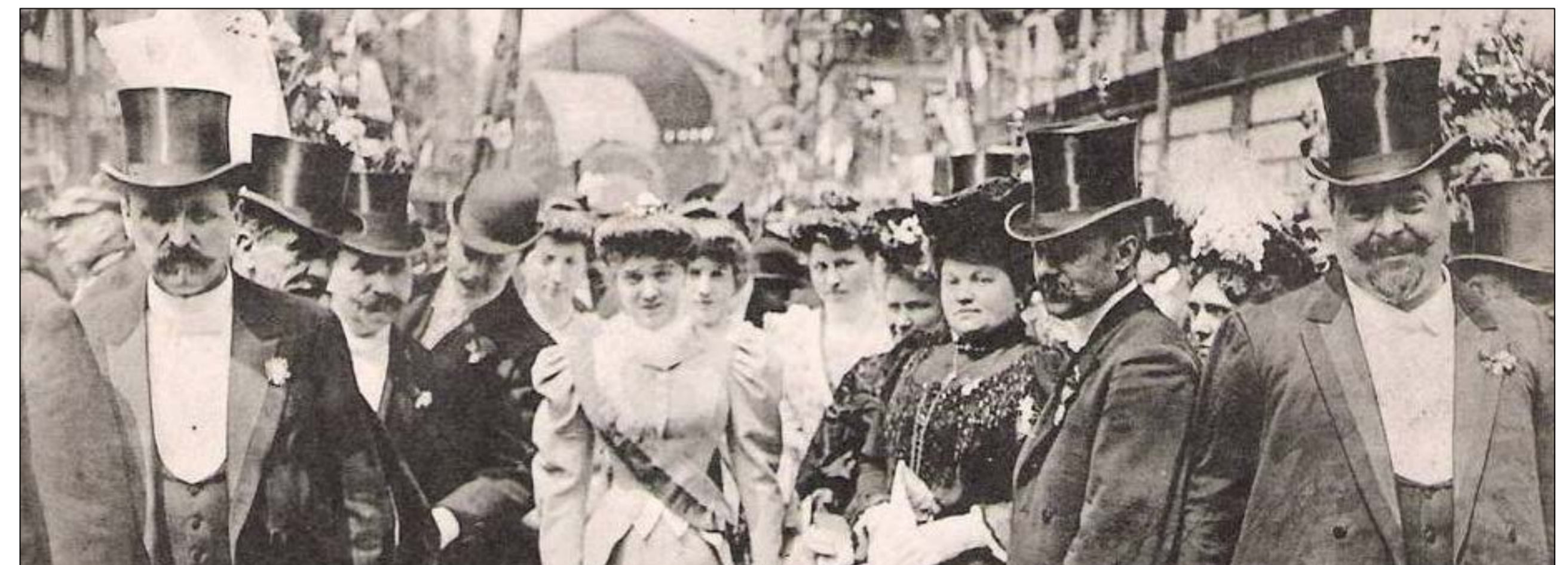
Post card, ca. 1910 (detail): "La Reine des Halles et son entourage lors de la visite du roi d'Espagne Alphonse XIII à Paris"