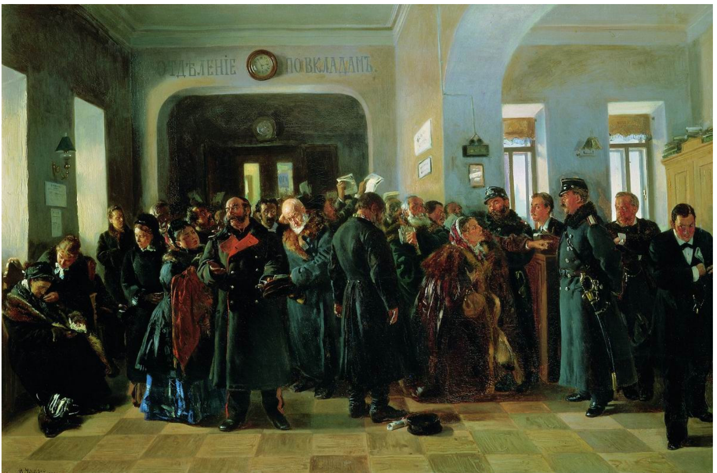
Vladimir Yegorovich Makovsky (1846-1920): Bankrupt Bank (Крах банка), 1881

Free entry upon reservation: event@dhi-paris.fr